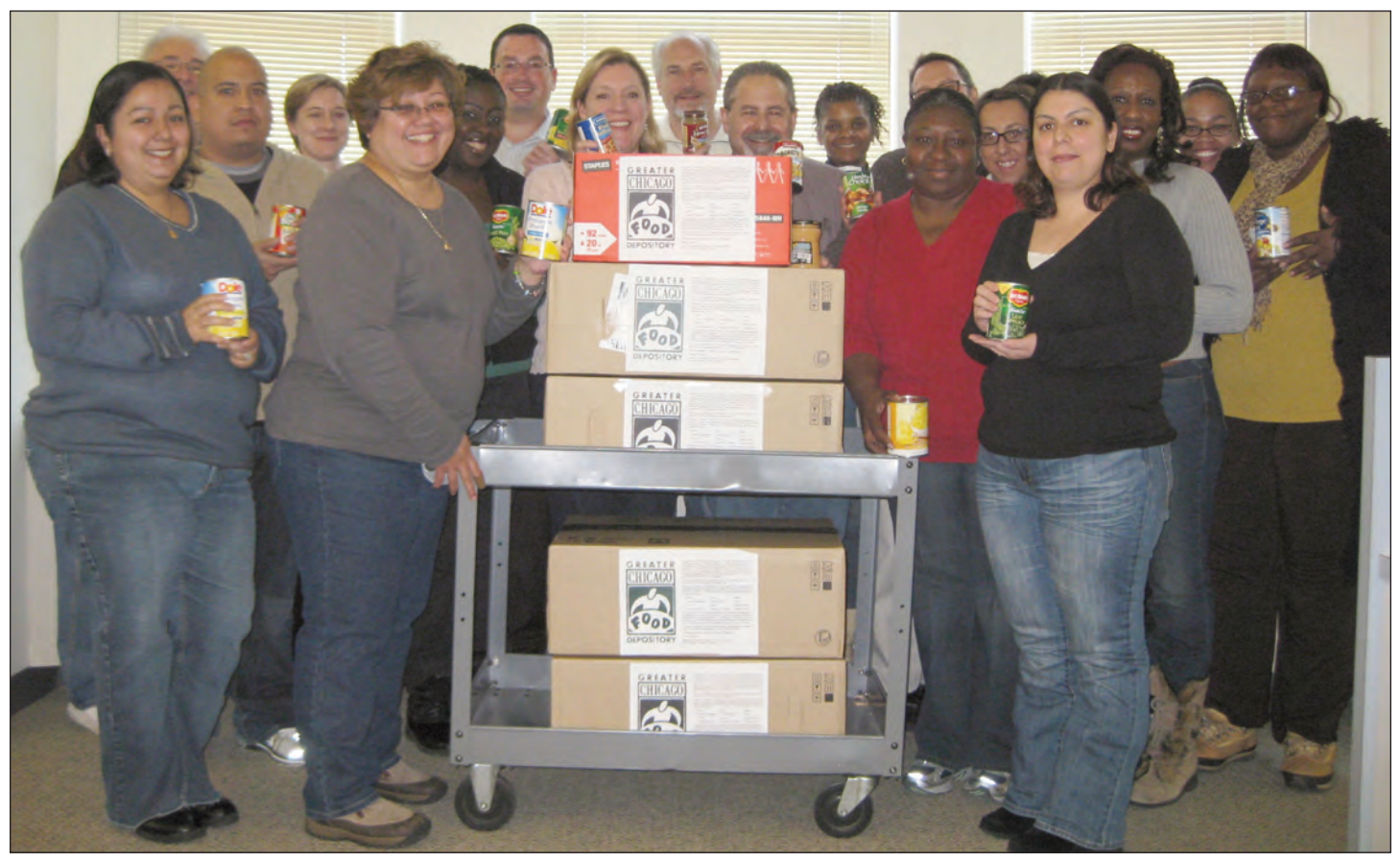
One City, One Food Drive - Chapter 13 Pitches In With Heart And Gusto!