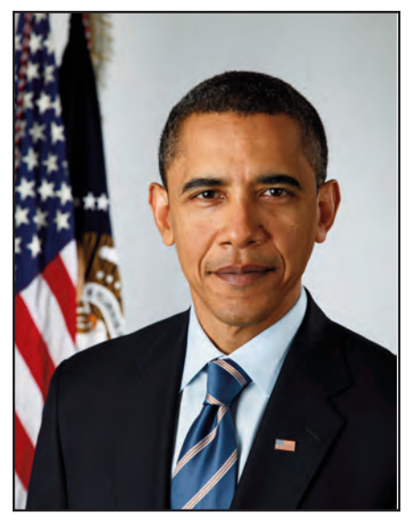
Barack H. Obama 44th President of the United States