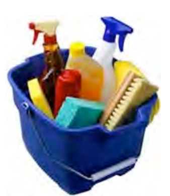
Time for some Spring Cleaning!

Any chore is easier with the right equipment. Have on hand a broom, dust pan, mop, vacuum, cleaning rags, scrub brush, bucket, sponges, step ladder, and paper towels. Use heavy duty cleaning products that are multi-use to cut down on the