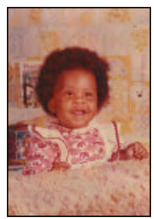
This baby looks like she's already talking!