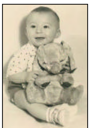
This baby started collecting toys very early on!