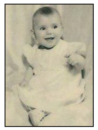
Show me the legs!